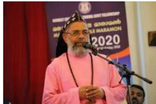
'MARUBHOOMIYILE MARAMON CONVENTION'