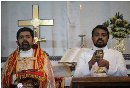
'NEW YEAR SERVICE'