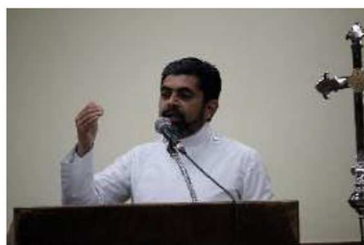
' CSI – MAR THOMA JOINT SERVICE